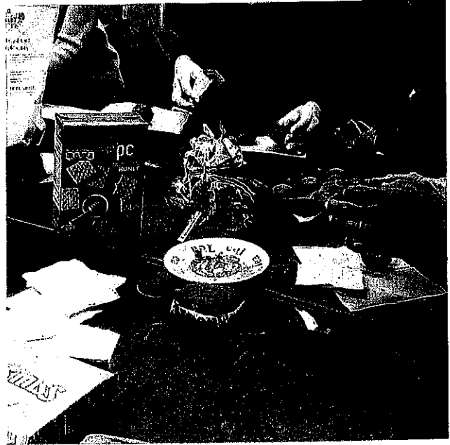
Hot Cocoa Bombs (Teen & adult program)