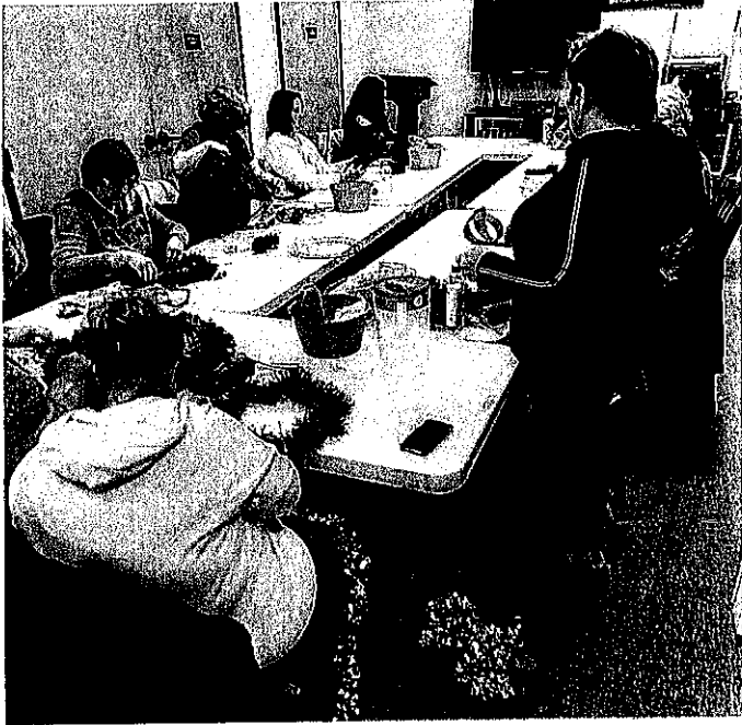
Winter Wreath Program (Teen & adult program)